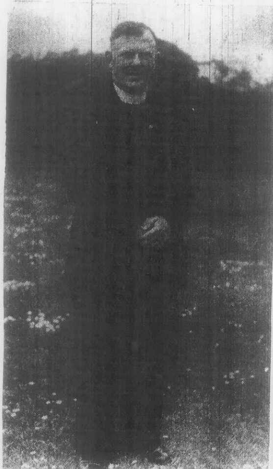
Picture taken in the grounds of St. Munchin's College this morning of the Bishop-Elect of Limerick.