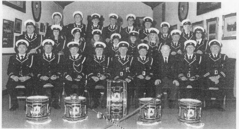
Striking up the band 125 years on.

newly installed floating moorings to the canal wall. The plans were approved by Waterways Ireland earlier in the year in preparation for this