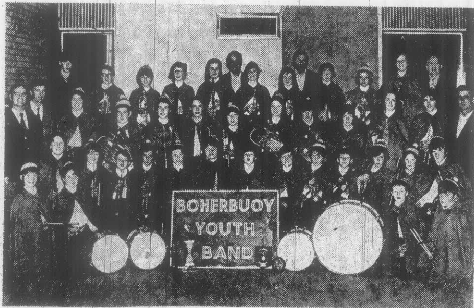
A recent picture of the Limerick Brass and Reed Youth Band, formerly known as the Boherbuoy Youth Band.

● THE Company ar other tour which prove time round. however, th with Limeri