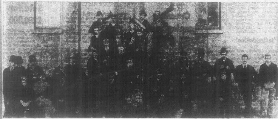
A photograph of the original Victuallers band taken in the 1860's. They are now, of course, known as St. John's Band.