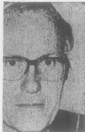
Newman: ecum- bedevilled by pol- itics."