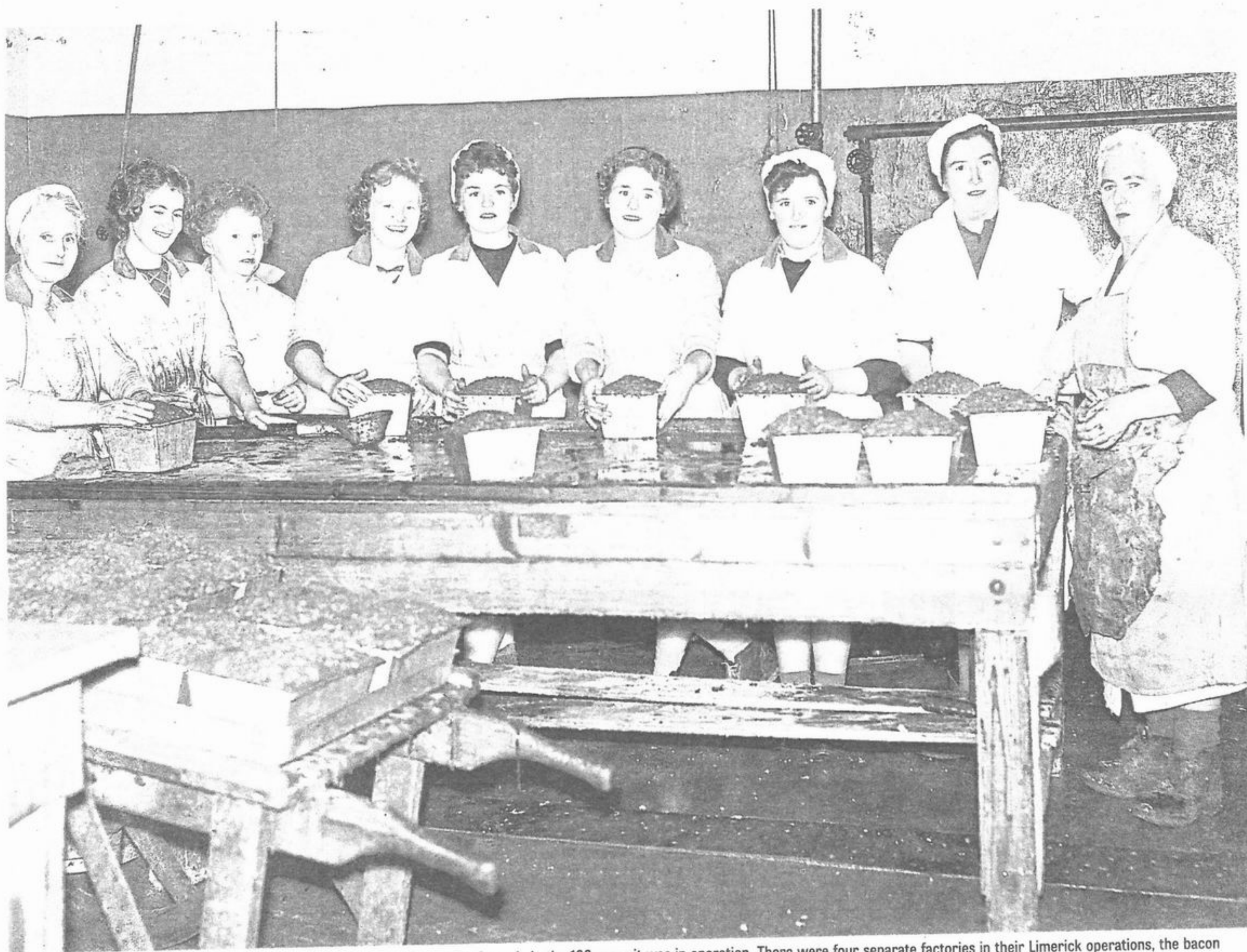
Mattersons's Bacon Factory in October 1961. Mattersons's employed thousands of people in the 166 years it was in operation. There were four separate factories in their Limerick operations, the bacon factory, sausage department, canning and meat/bone waste

PICTURES CAN BE PURCHASED FROM THE LIMERICK LEADER AT 54 O'CONNELL STREET OR FROM PICTUREORDERS@LIMERICKLEADER.IE