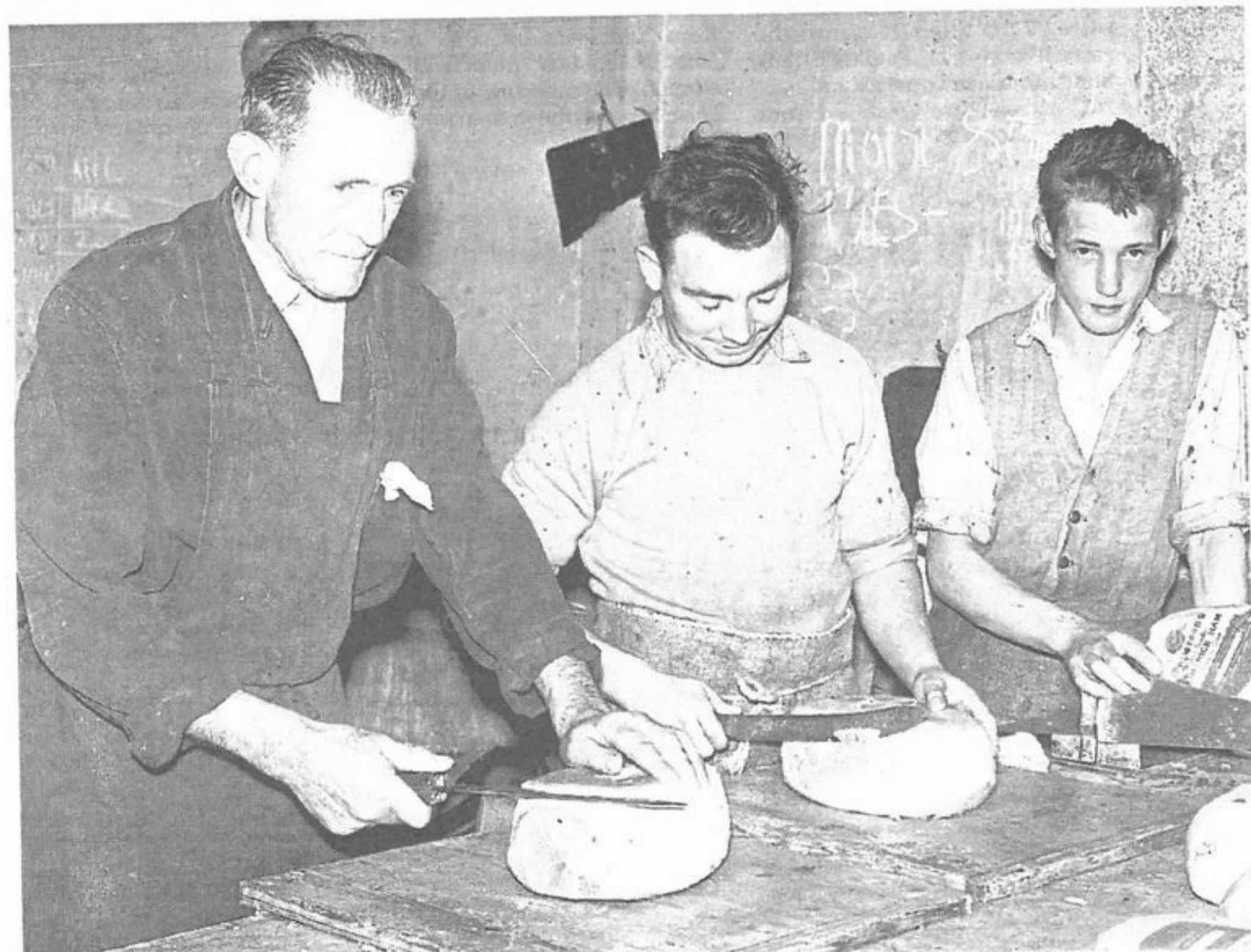
Matterson's Bacon Factory in October 1961