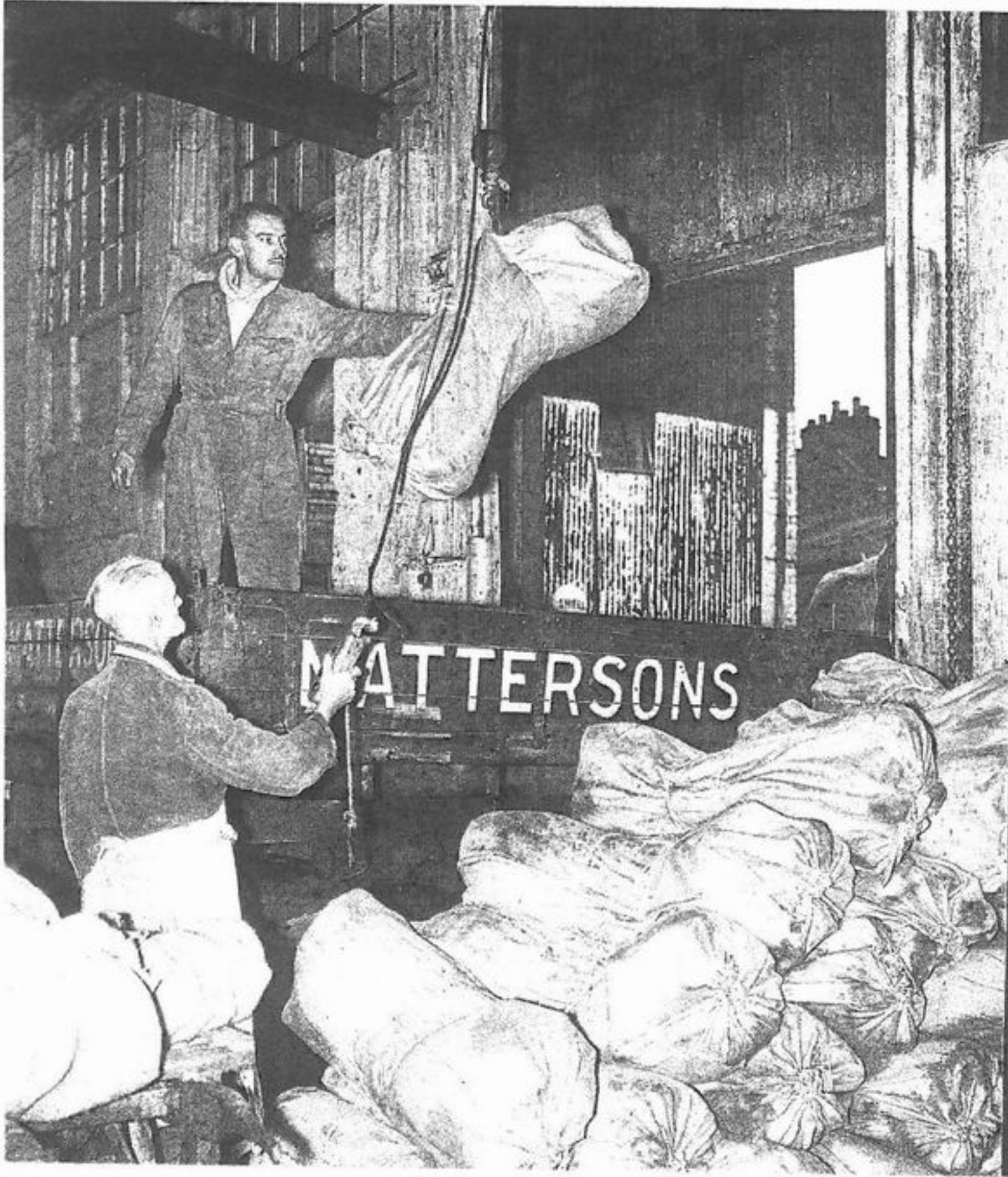
Matterson's Bacon Factory taking deliveries in October 1961. Matterson's was one four great bacon factories in Limerick. The others Shaw's, O'Mara's and Denny's making Limerick famous the world over for its ham