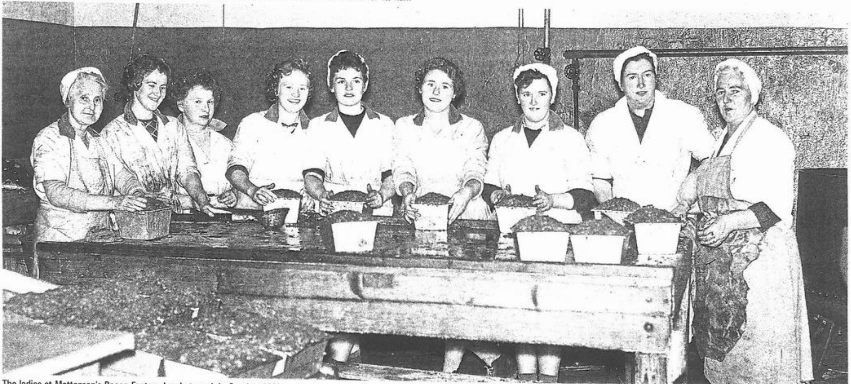
The ladies at Matterson's Bacon Factory hard at work in October 1961