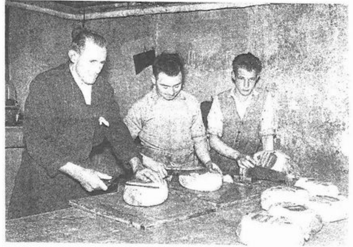
The final chop at Matterson's Bacon Factory