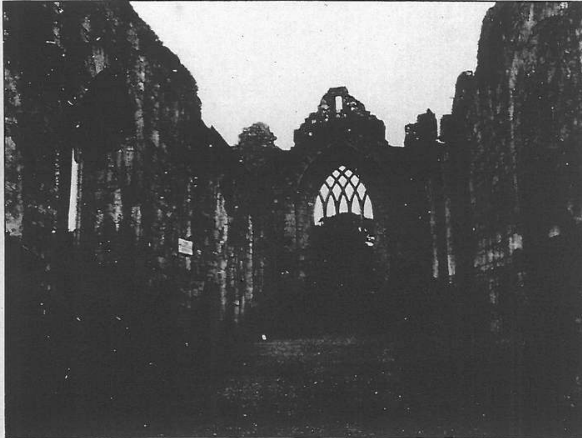
The main chapel area in the abbey