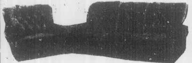
Amphora Suite ..... £665