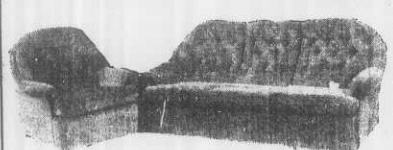
Paris Suite ..... £519