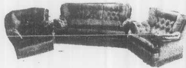
Carlton Suite ..... £519

IT HAS COME TO OUR ATTENTION THAT MANY PEOPLE HAVE YET TO SEE THE FANTASTIC VALUE WE HAVE TO OFFER SO HERE'S A LITTLE INCENTIVE FOR CHRISTMAS *FREE TURKEY AND HAM OR £25 CASH DISCOUNT WITH EACH 3-PIECE SUITE PURCHASED