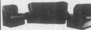
Crescent Suite ..... £415