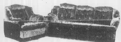
Highlander Suite £515