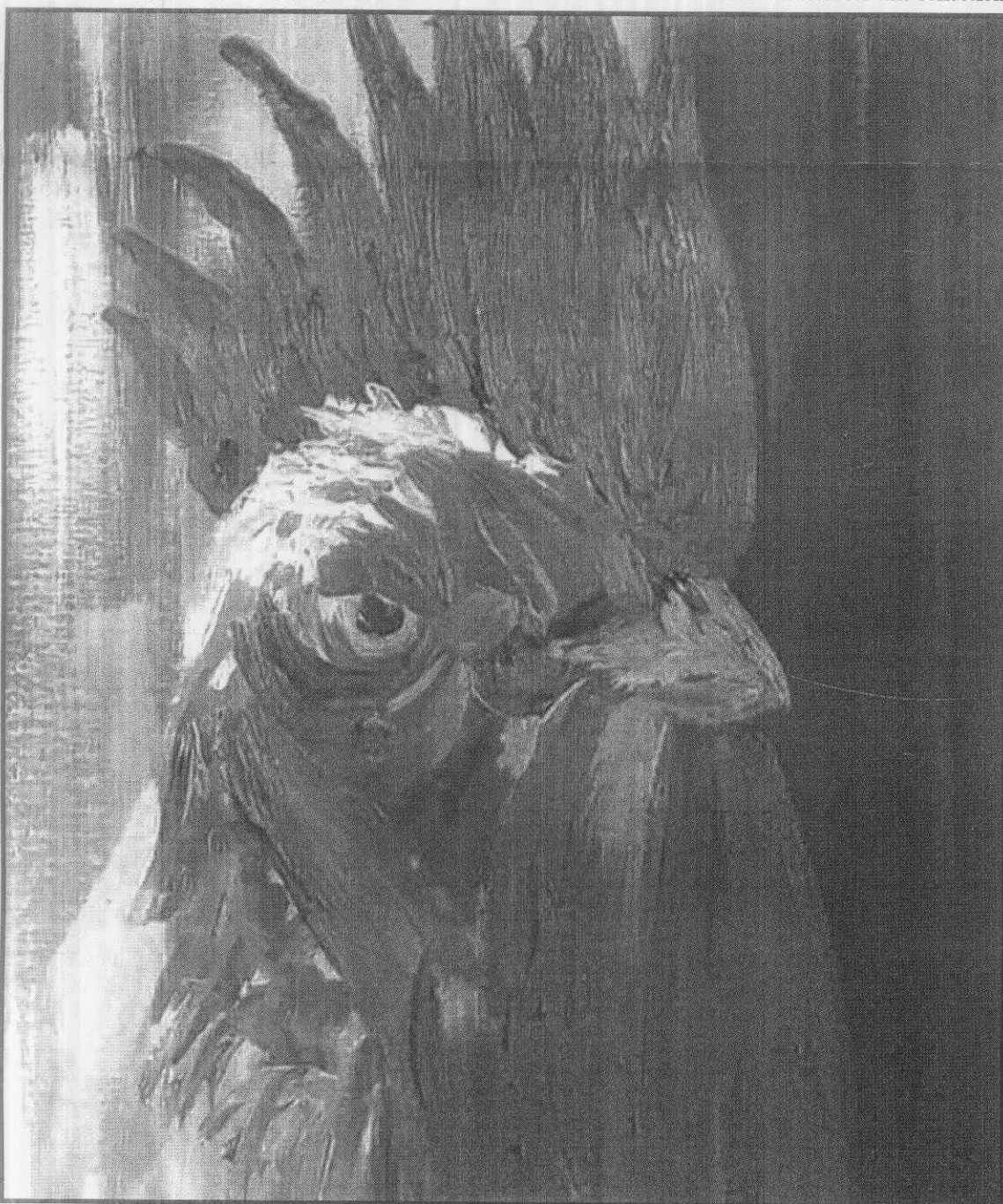
The King of the Ring