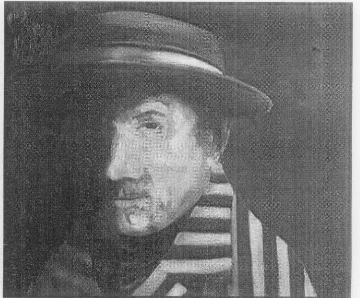
... and the Ringmaster's Apprentice

For more information, call the Normoyle Frawley gallery on 061-315401 or log onto at www.nfgallery.com