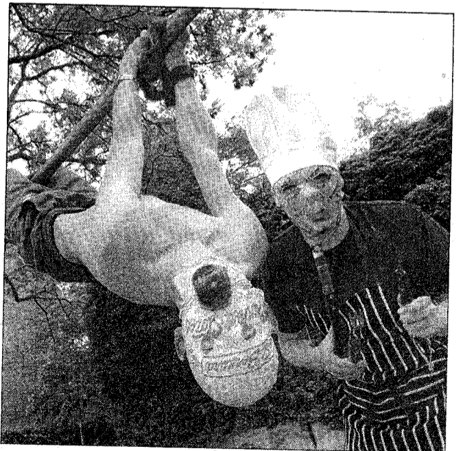
Yurt: Rubberbandits rubberstamped a Moyross win