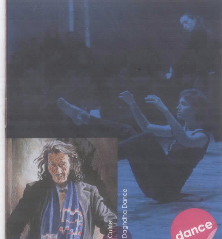
Cuisle Daghdha Dance