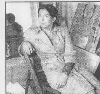
Left: Coastal Landscape by Donald Teskey Top: Radio Waves by Diane Copperwhite Above: Diane Copperwhite

cess, exceeding all expectations by realising almost £900,000 or €1.4 million. This year's sales surpassed last year's figure, with a total of £1,002,550.