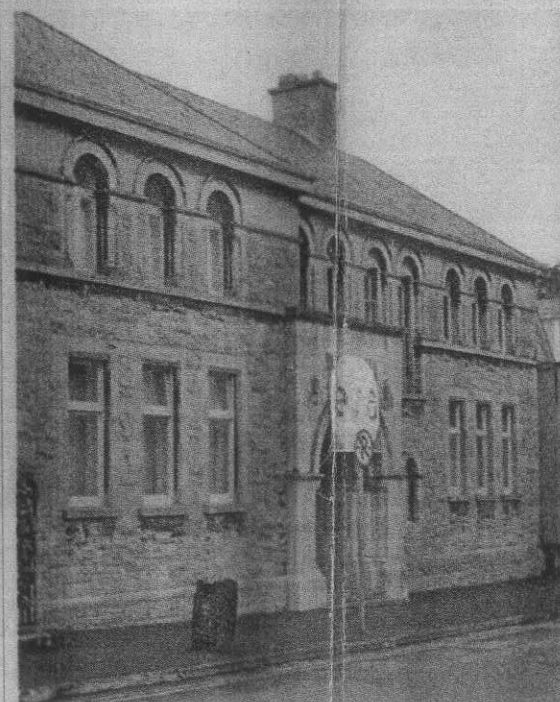
Limerick City Gallery of Art: major renovations planned (LL)

This offer is made under a Hire Purchase agreement as defined by the Consumer Credit Act (1995). Subject to current credit criteria. A guarantee may be required. RRP excludes delivery and related charges. A deposit/trade-in of 50% is payable when acquiring the vehicle. The remaining 50% is repayable by the customer in one lump sum (i.e. the Final Payment) in January 2009. This is a finance offer. Terms and conditions apply. Offer applies to retail sales only, registered between 01.01.07 and 31.03.07. Offer excludes Commercial Vehicles. Credit Opel loans are underwritten by permanent tsb Finance. permanent tsb Finance is the consumer finance subsidiary of Irish Life & Permanent PLC which is regulated by the Financial Regulator. Model shown is Astra Sport Hatch SRi 1.8i 16v. Fuel consumption 17/100km: urban 10.1, extra urban 6.0, combined 7.5. CO 2 emissions: 180g/km. [WARNING: You will not own these goods until the final payment is made.]