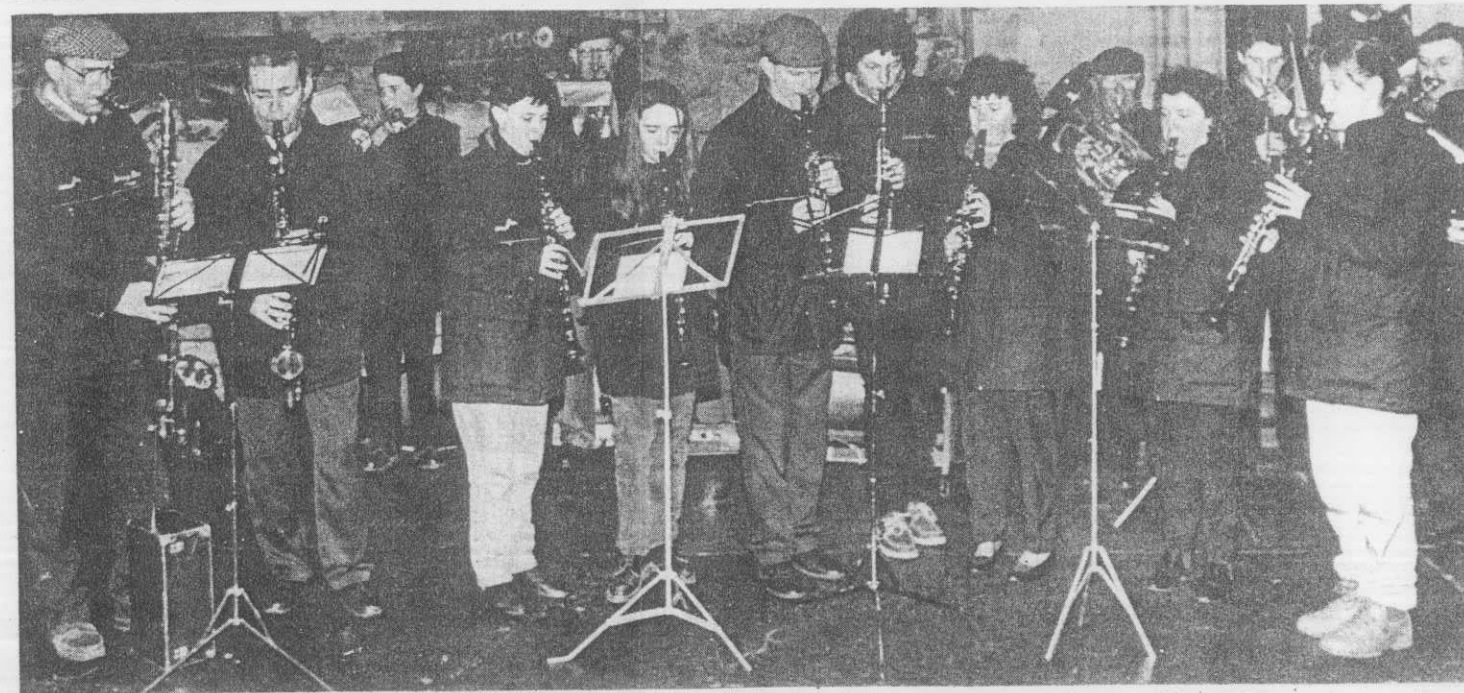
Members of the Boherbouy Band perform at the opening of EV+A at the City Gallery.