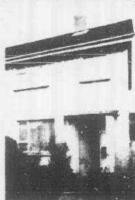
The house in Southill.

She said that she would be quite willing to leave if accommodation could be got for her somewhere else.