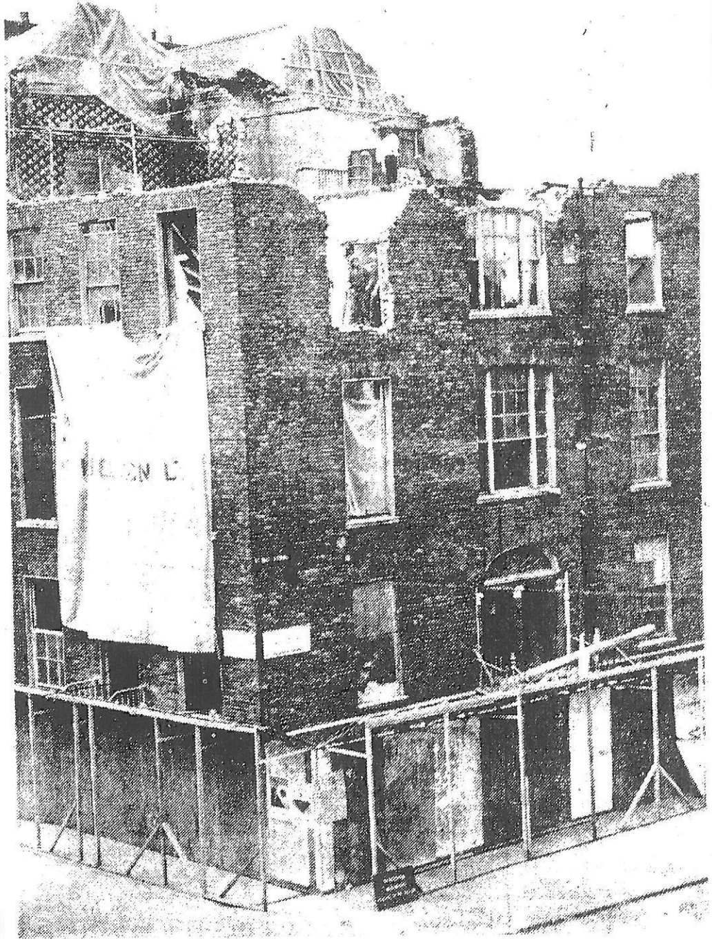
Demolition men at work on Georgian Limerick this week... but the building will be restored to its former glory.