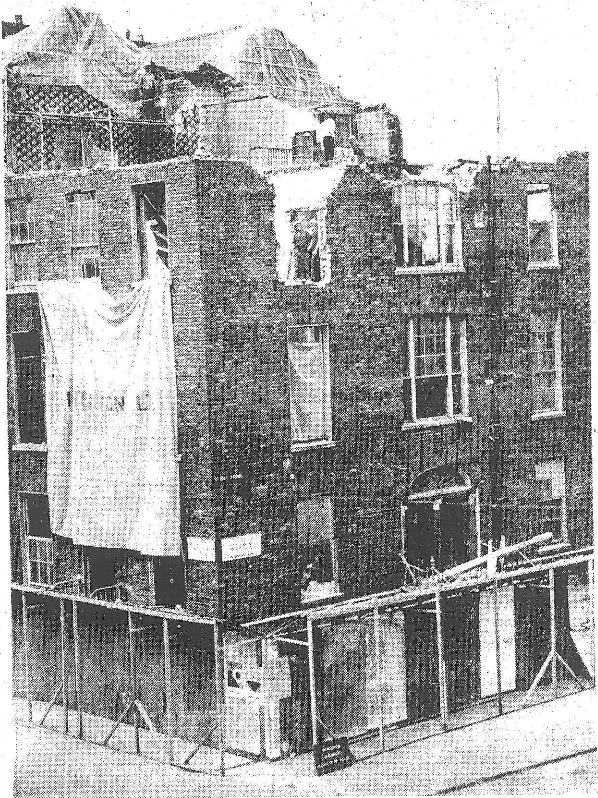
Demolition men at work on Georgian Limerick this week ... but the building will be restored to its former glory.