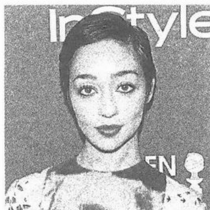
Limerick raised actress Ruth Negga's trajectory is on the up and up

large family in Limerick, where she grew up after moving to the city from her birthplace in Addis Ababa, Ethiopia, where she lived until she was four.