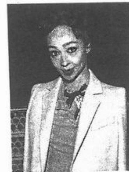
Limerick actress Ruth Negga

It was developed with the support of the Irish Film Board.