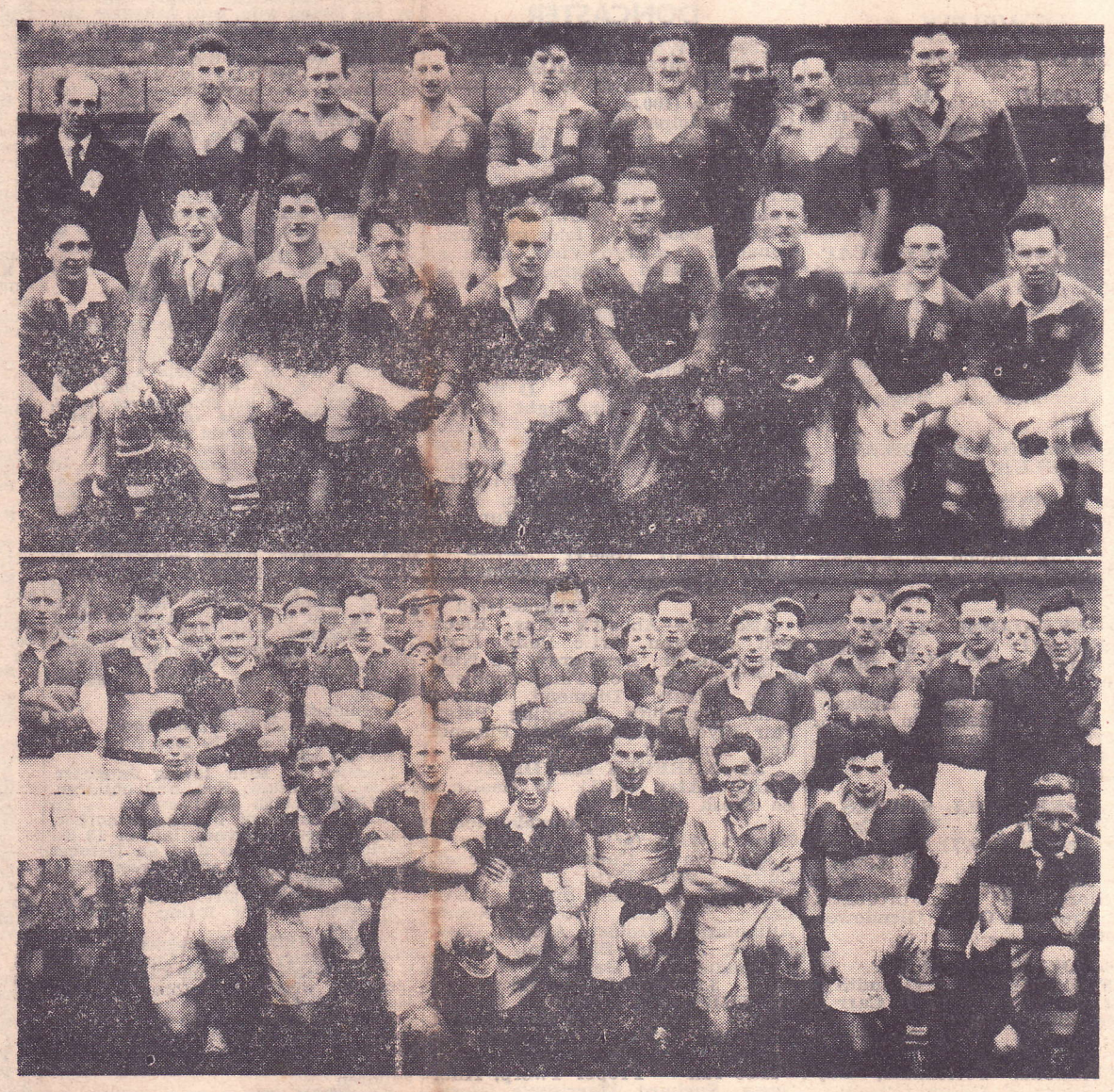
Top photograph is of the Treaty-Sarsfields team that defeated Pallas in the County Senior Football Final at Limerick Gaelic Grounds on Sunday. The second group is of the Pallas team.