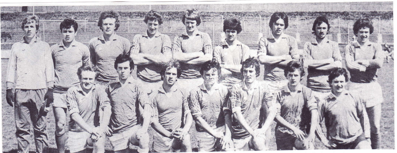
Thomond College beaten by Oola in the senior football championship.

Waterford R.T.C. deserved their five points winning margin from this Higher Education division 3 hurling league game at Monaleen on Saturday but the issue would have been close had the Limerick side availed of some of the good scoring chances which came their way.