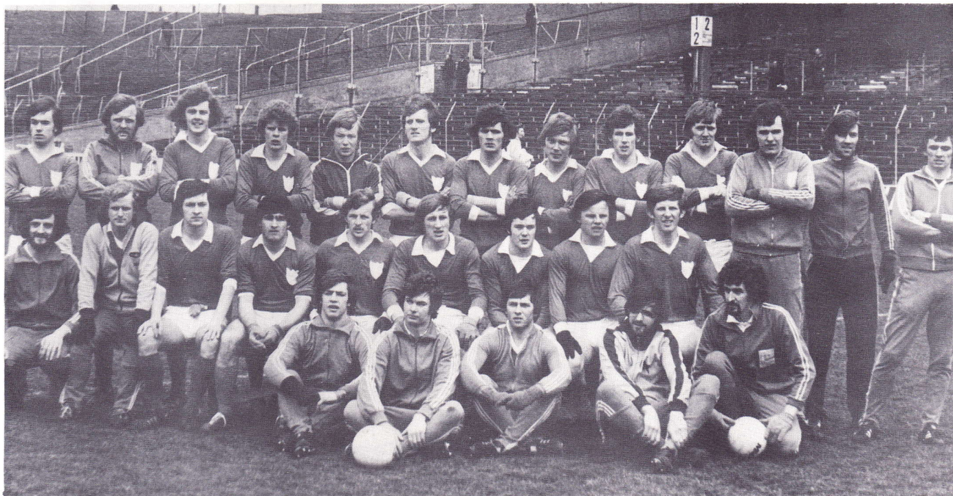
All-Ireland Club Champions 1978—Thomond College