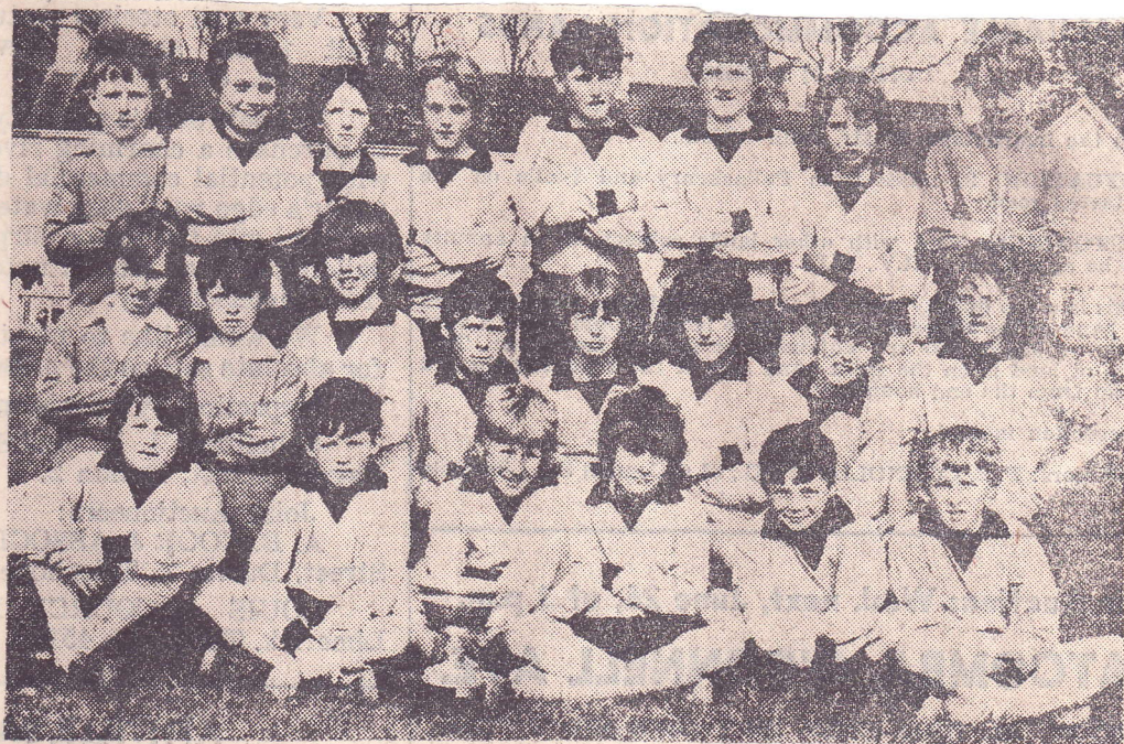
St. Mary's G.A.A. Club u-13 football team that won the Davin Motors Cup recently. They defeated Monaleen in the final.

The under 14 hurling championship started last Saturday. We played Cloughaun in St. Munchins College. A fine game of hurling was witnessed and Cloughaun won by a goal. Our boys put on a great display and played with great spirit.