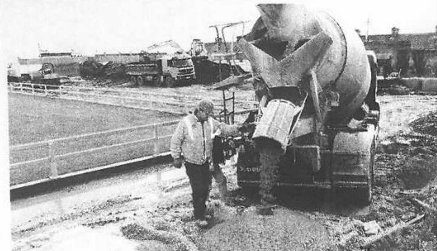
Work is continuing on the new-look Markets Field Stadium which, when completed at the end of the month, be a Category 2 UEFA stadium with a capacity of 3,075