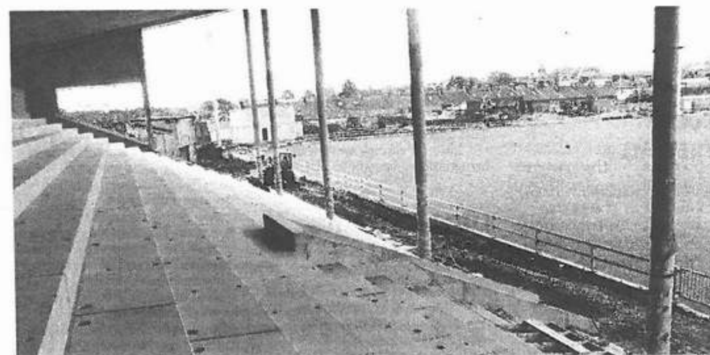
The main stand at the Markets Field where seating will be put in shortly. It will boast a capacity of 1,340