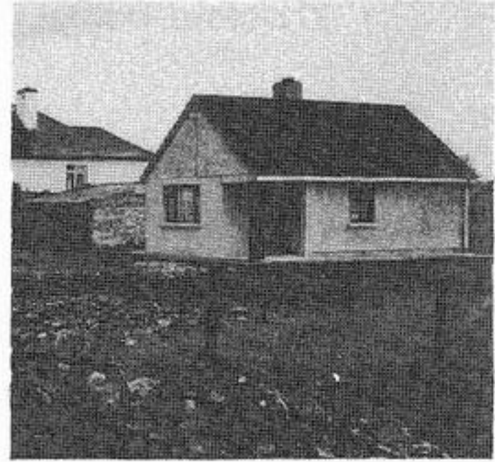
Front (above) and back (below) of a fine thatched byre-cum-dwellinghouse at Dulick, Ennis, Co. Clare, which was destroyed in 1975—and its replacement! (See Editorial)