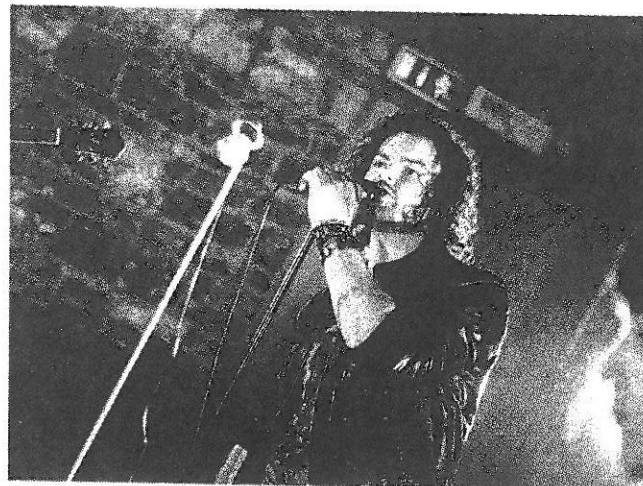
Limerick rock band Raging Sons released their debut single Lust last week and will play in Dolan's Warehouse on August 21

Raging Sons, who formed in 2012, have in the past supported Riptide Movement,