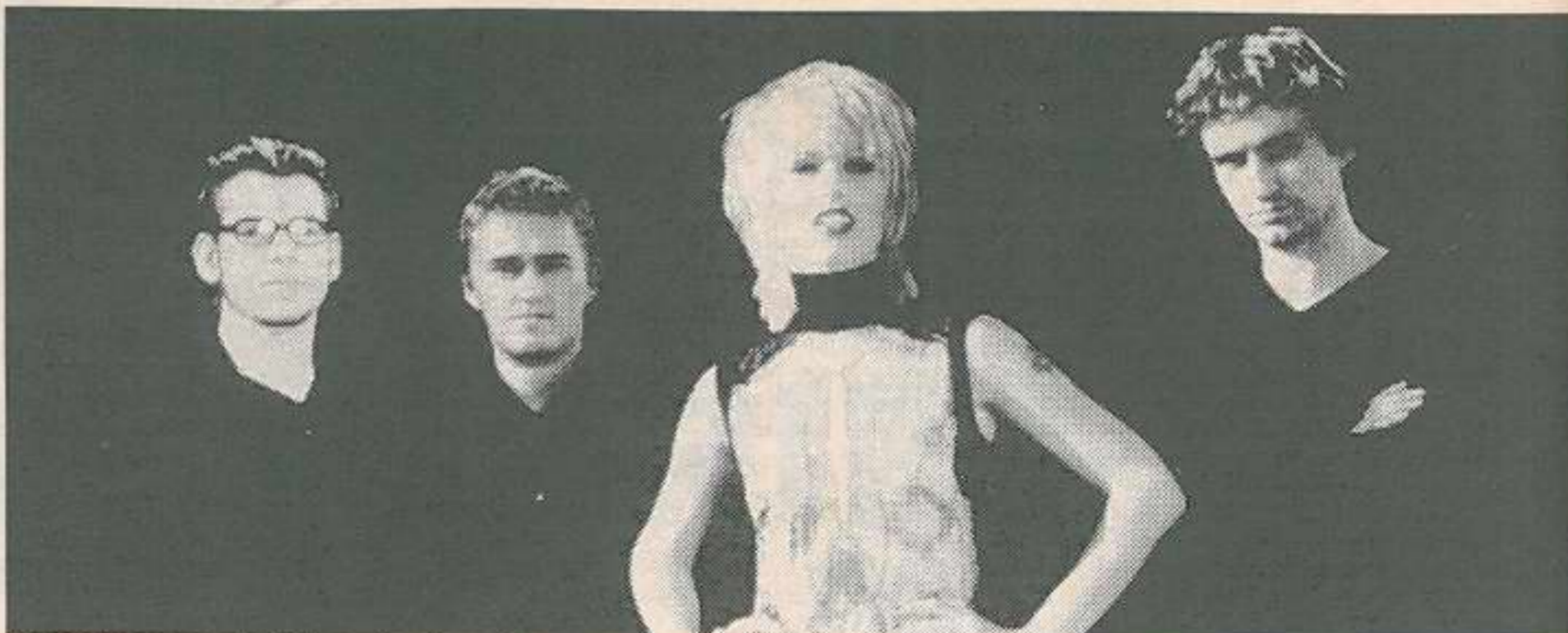
The Cranberries: even Phil Collins reckons they rock

Does she think that Massive were right to give Fergie the bird? "God, that girl gets such a hard time!" she sympathises. "I wouldn't do that to anybody. If somebody put their hand out to shake mine, I wouldn't pull it away unless I had a personal grudge. I think that Massive Attack thought it was a set up, and that someone was taking the piss out of them by doing that. It was strange having someone like her presenting an award but, at the same time, I don't have anything against her."