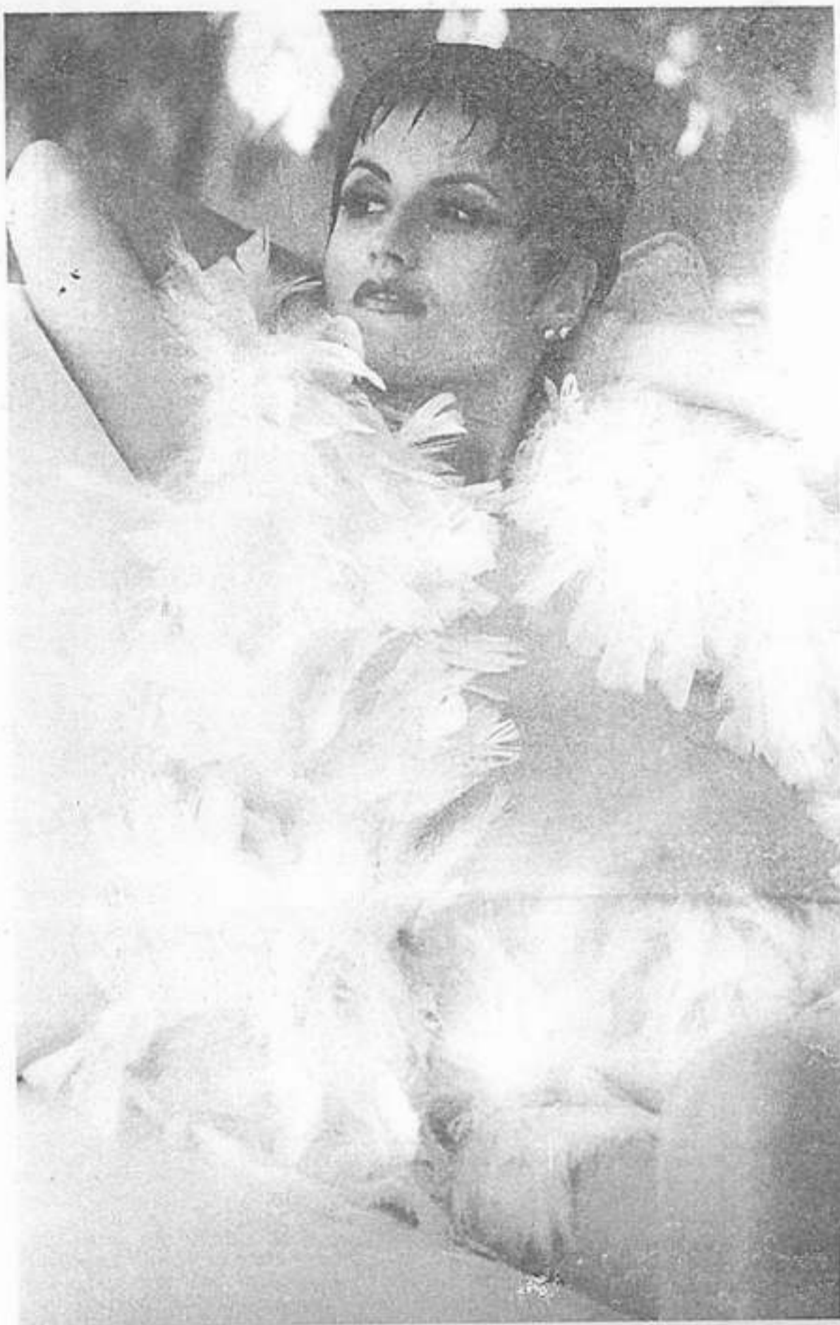
Dolores O'Riordan: I feel sad at times that we do not get the recognition in this country that is due to us for our achievements

Mulled wine and mince pies will be served. A carol service will take place in the centre that evening at 8pm.