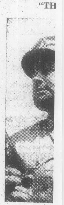
The Chief of Pol lecto—dead or all shoot. A scene Not The Song," Demc

To all con- gratulations, a come back soc