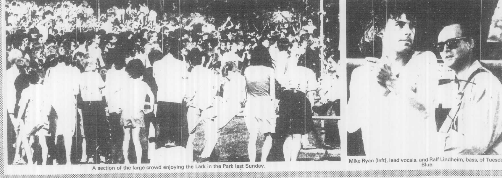
A section of the large crowd enjoying the Lark in the Park last Sunday.

Finally, if you didn't attend — I hope you're sorry now. Ah well, there's always next year!