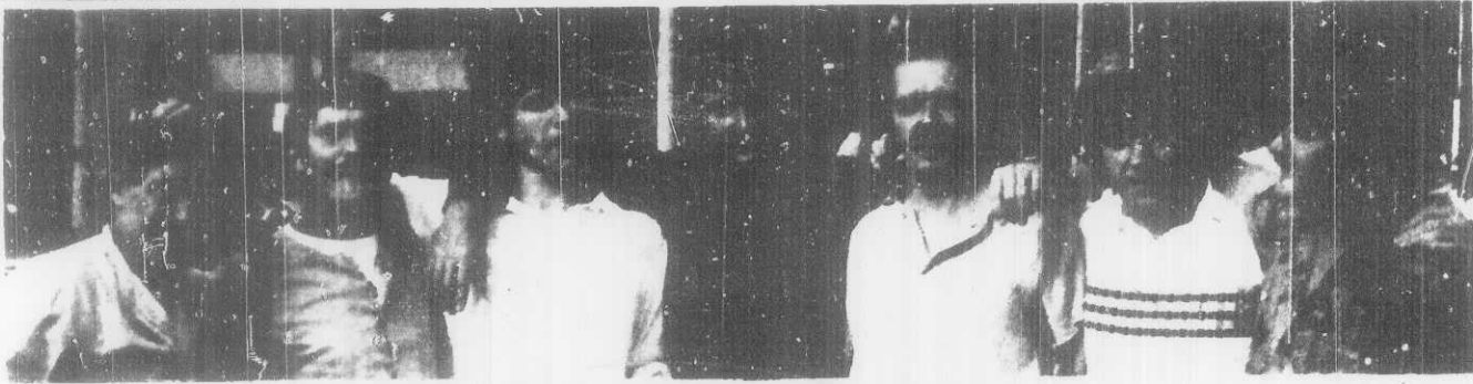
Granny's Intentions: summer re-union planned.