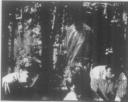
Cork band Cypress, Minel who are appearing at the Top Floor, Savoy, this Friday night.