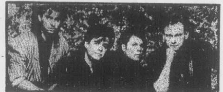
Mr. Mister who are No. 4 in the local charts this week with "Kyrie".

Golden Discs positions only on 12 inch charts.