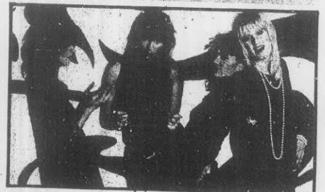
The Bangles: No. 4 in the English charts and the highest new entry at No. 4 in the Limerick charts.

Golden Discs positions only on 12 Inch Chart.