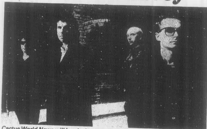
Cactus World News will be playing in the Savoy on Sunday night. A big crowd is expected to hear the band play such tracks as "The Bridge" and "Years Later" - their two great singles.