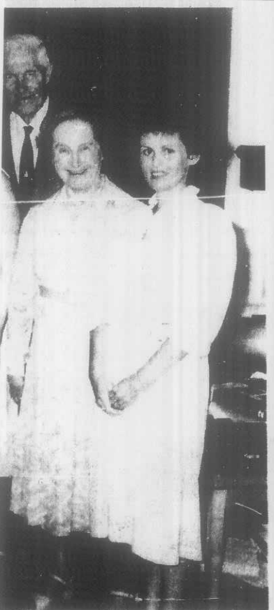
annual golf outing at Castletroy Golf

ames for modern infrastructure, suspended, while Dublin in ion from onfidence