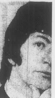
• Shaun O