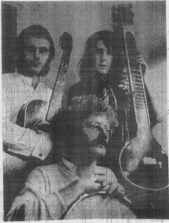
Skid Row star at the City Theatre to-night.

A list of those invited has been forwarded to all concerned, and they and their friends are invited to attend.