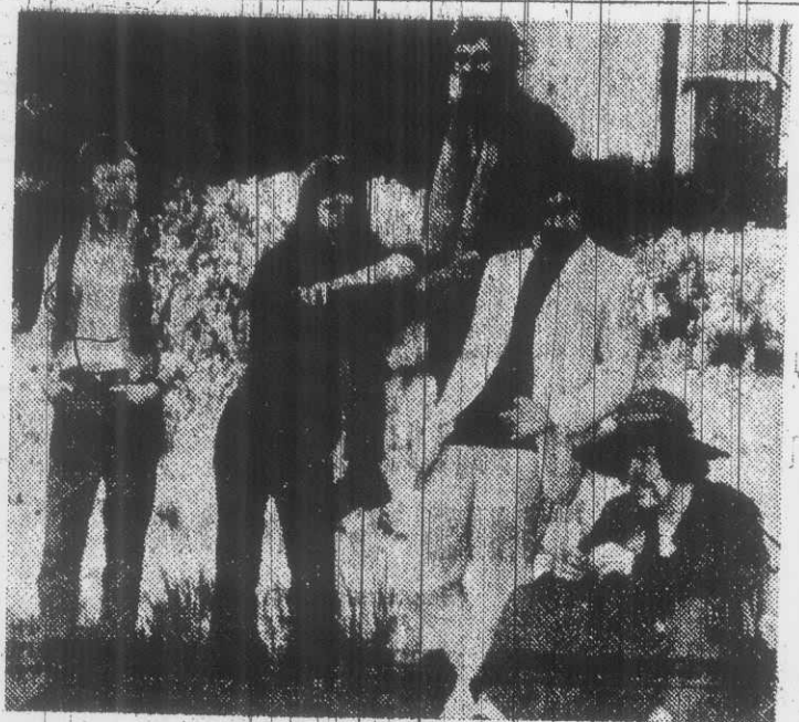
Next week's big attraction to the 'Tabu' club will be the 'Orphanage,' They are by far one of the up and coming young beat groups. Recently they were here in the 'Tabu' club where they received a great crowd.