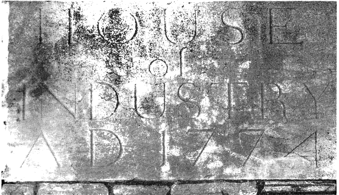
The foundation stone of the House of Industry, laid in 1774.

The building now known as the Strand Barracks, used since the mid-thirties by the Limerick Corporation as its main depot and stores, has a long and interesting history. A study of this history tells us much about social conditions in Limerick since the date of its foundation as far back as 1774 as the House of Industry, to its closure some time after 1842 when the first Union Workhouse for Limerick was opened for the reception of the poor.