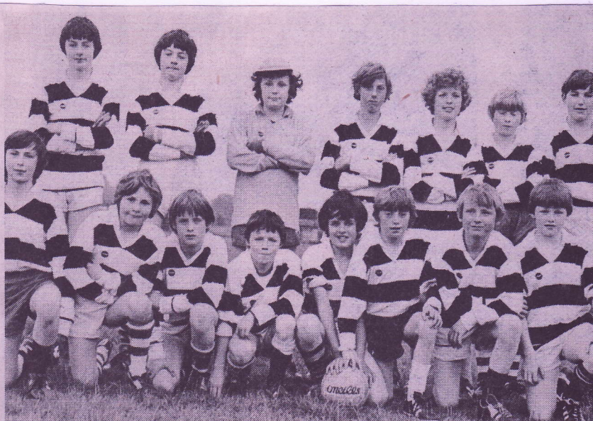
Galbally, winners of the South under 12 Football Championship. 6-9-80