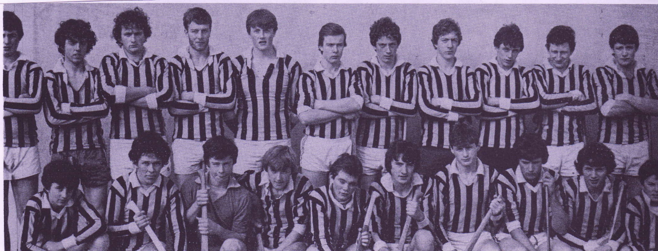
GARRYSPELLANE WINNERS OF THE SOUTH MINOR HURLING CHAMPIONSHIP