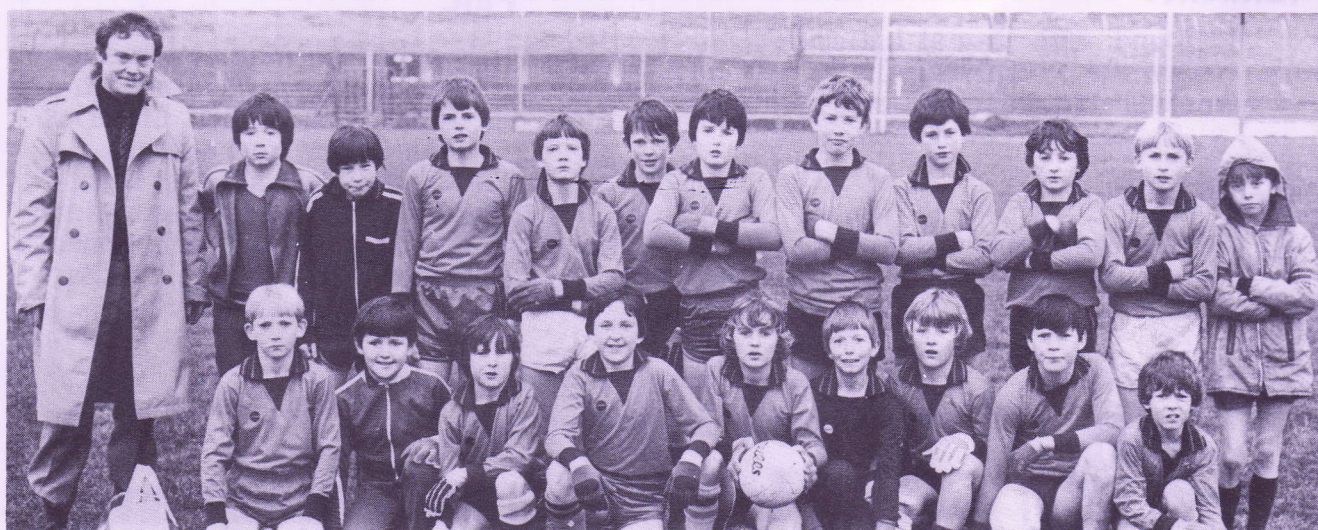
ST. BRIDGET'S N.S. SINGLAND U/13 FOOTBALL TEAM 1981 WINNERS OF PRIMARY SCHOOLS LEAGUE. THEY ALSO WON THE COMPETITION IN 1980 BUT WERE FOILED THIS YEAR FOR THE THREE IN A ROW BY BALLYBROWN