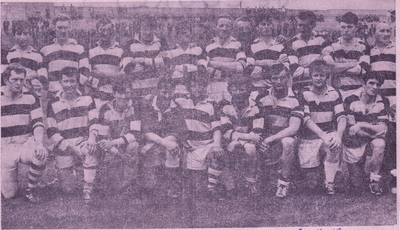
Galbally, beaten County football finalists.