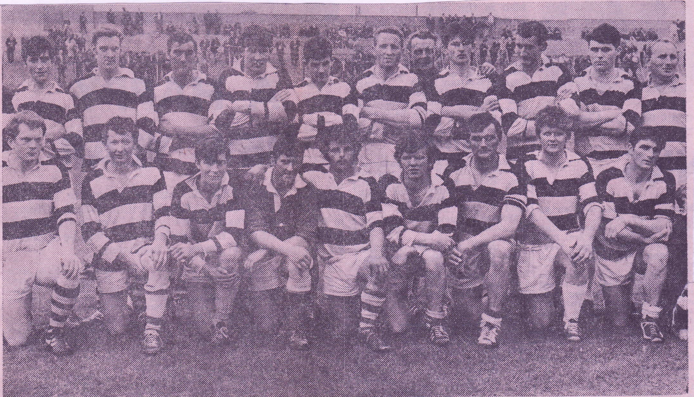
The Galbally senior football team which lost to Claughtaun in the County final. It was Galbally's first-ever appearance in a senior final.