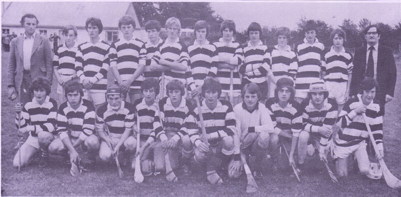
The Granagh-Ballingarry team, West under 14 hurling champions, who failed narrowly to Old Christians in the County Final. 1978