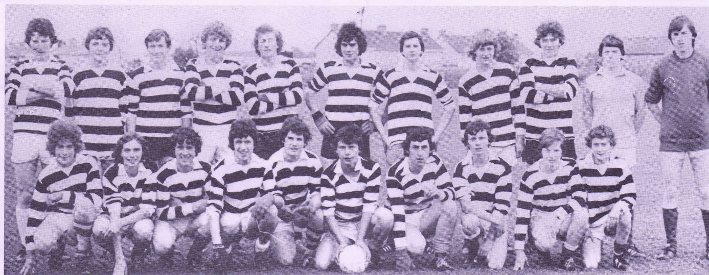
SOUTH MINOR FOOTBALL CHAMPIONS