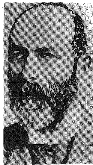
Patrick Weston Joyce.