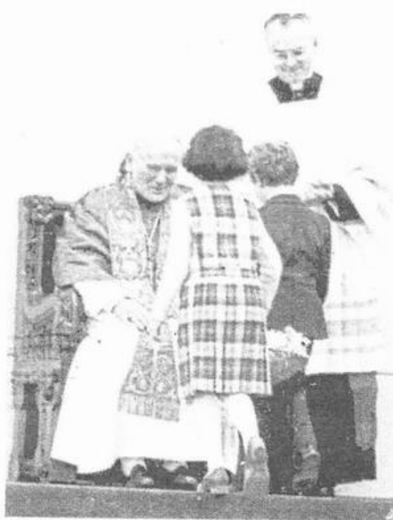
One of the many photos from our photo archive of Pope John Paul II's visit to Limerick, where a young boy and girl were privileged to meet the Pontiff