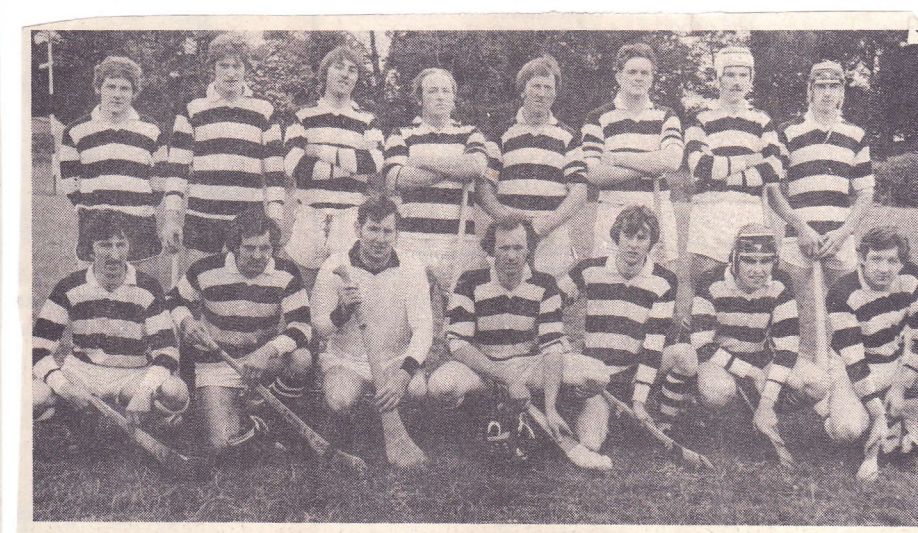
The Granagh team which caused a surprise by defeating Adare in the Wes Limerick S.H. Championship.

Granagh doggedly maintained their will not to be beaten, while Adare, with equal determination, tried to coax the game their way, but they never succeeded in find-ing the right blend. I think that Adare failed to reproduce the form that beat Ballingarry and Newcastle West and perhaps the reason isn't hard to find.