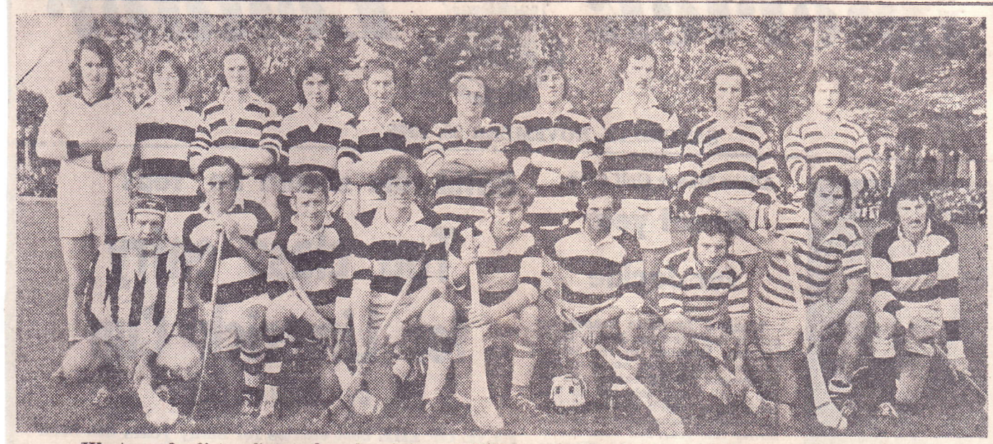
Western finalists, Granagh, who defeated Kilfinane in the junior semi-final at Bruree on Sunday.