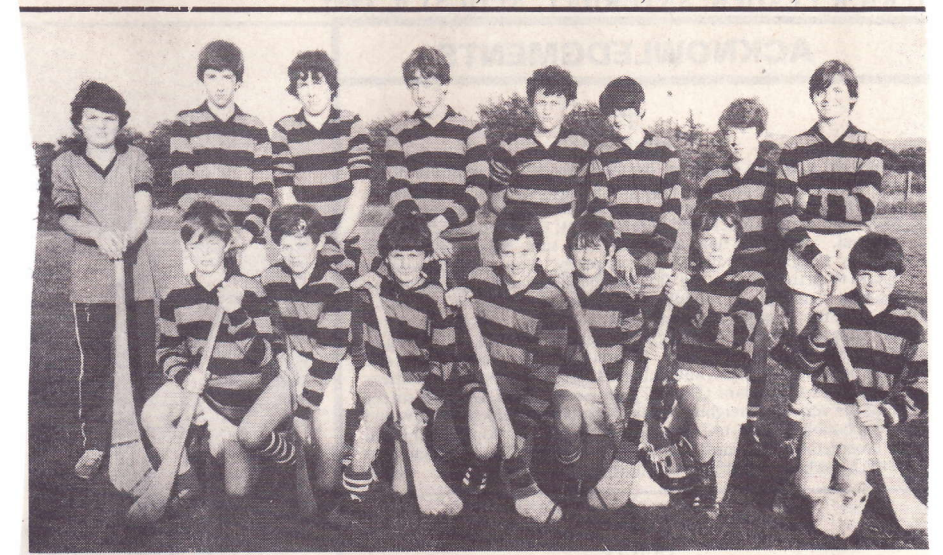
Granagh-Ballingarry, who beat Newcastle West 3-2 to 1-0 in the under-14 hurling final at Knockaderry.

Granagh had a good win over Ballingarry in the novice junior hurling at Knockaderry last Sunday, 2-5 to 1-3. Granagh seniors are out for the first round of the senior hurling championship next Sunday at Bruff. Granagh beat Newcastle West in the first round of West championship by 7 pts. last Sunday. Granagh drew with Athlacca in the Meanus tournament last Friday.