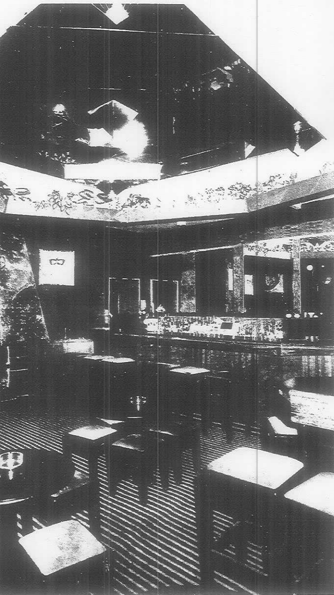
The new TIFFANY'S BAR in Cruise's Hotel, Limerick