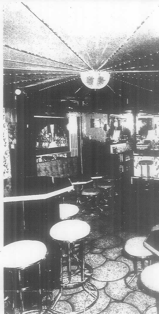
RUBY'S NITE CLUB in Cruise's Hotel, Limerick

re Happy to be ted with Cruise's d wish them well th their new