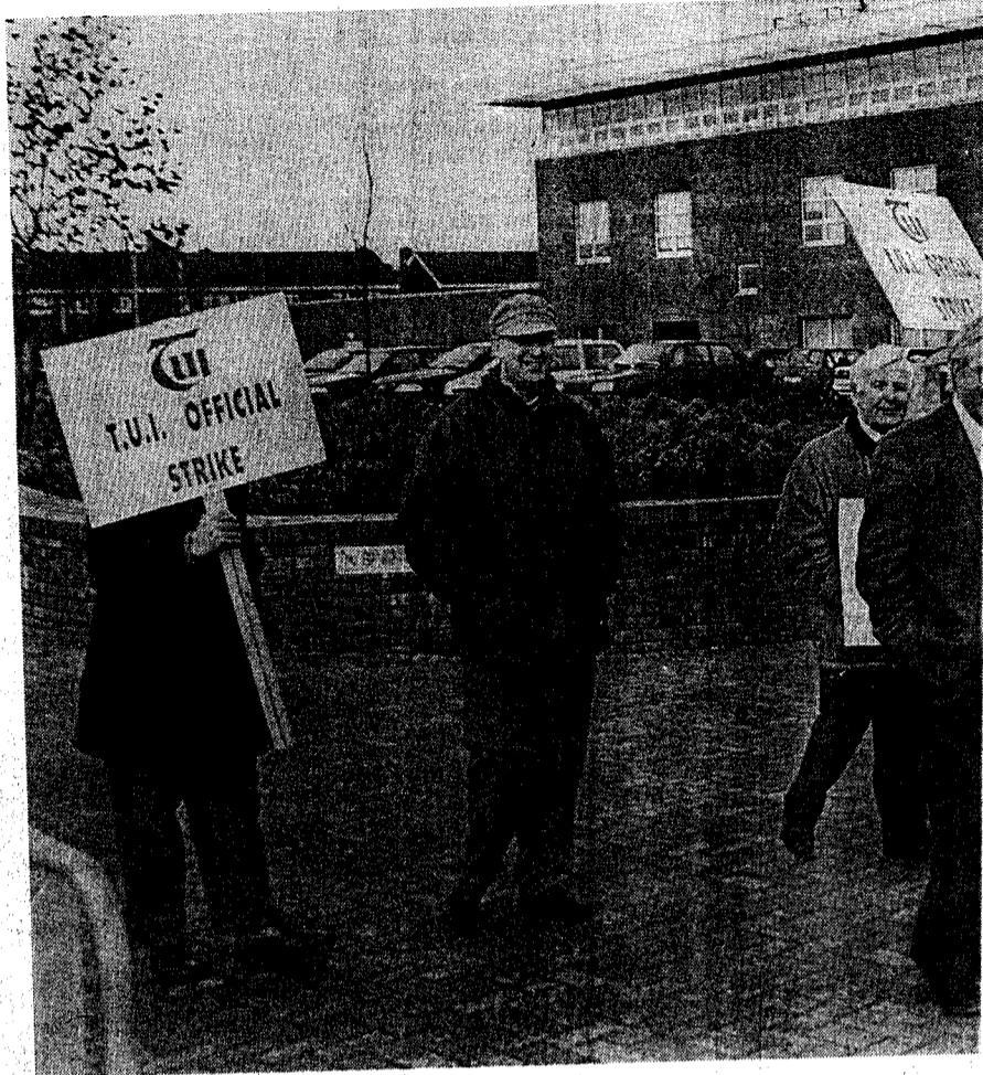
Protest: TUI members on picket duty outside Limerick RTC this Wednesday

They say that a college proposal to offer alternative part-time hours to the teacher was rejected by the union, who they claim, have not responded to management invitations to meet