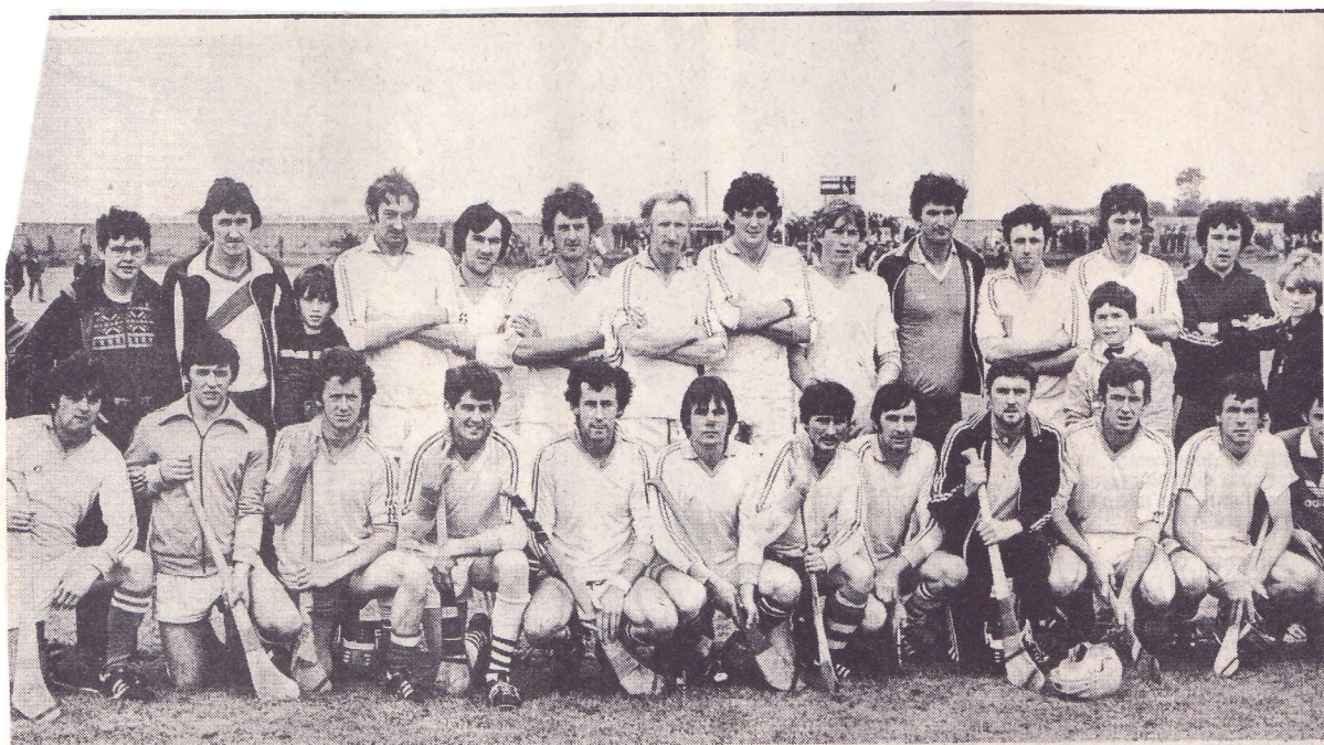
The Bruree team that had an easy win over Mungret in the county senior hurling championship semi-final at Rathkeale on Sunday. 4-9-82