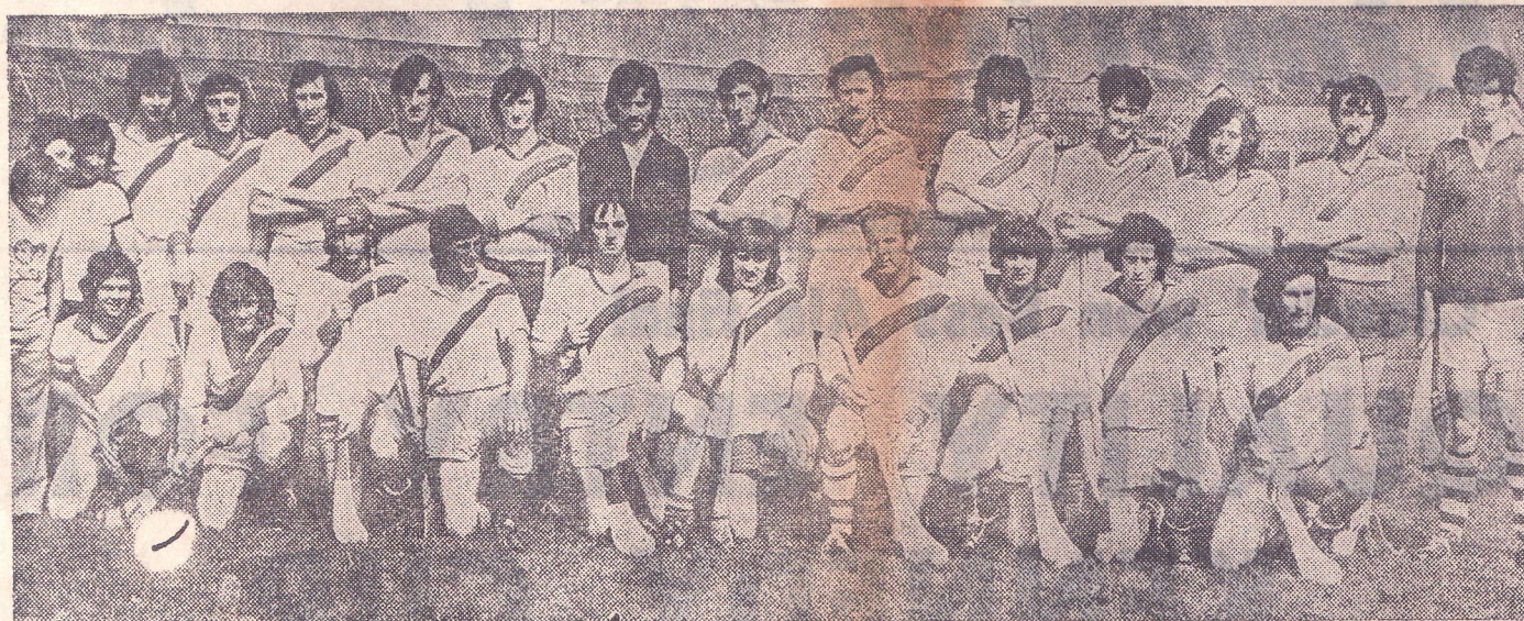
The Bruree team, beaten by Patrickswell in the semi-final of the County Senior Hurling Championship.