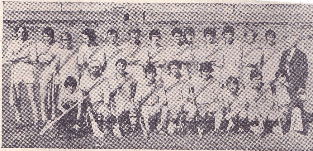
Vanquished — Bruree.