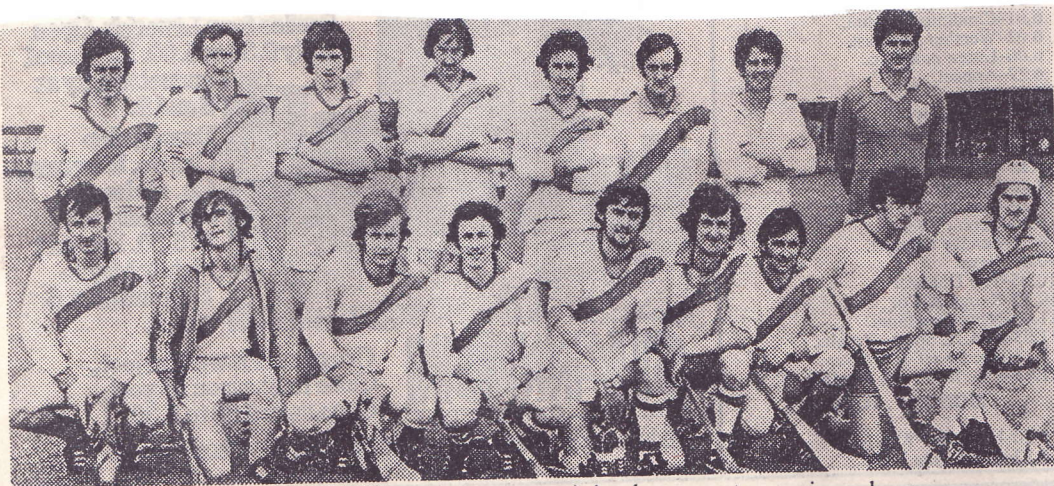
Bruree (above) who drew with Bruff (below) in the county senior champ