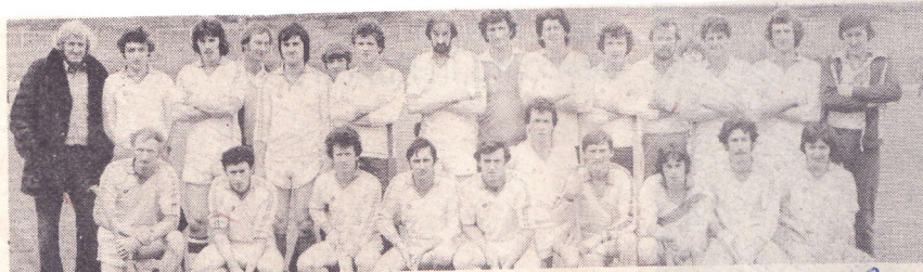
The Bruree team beaten by South Liberties. 20-9-80