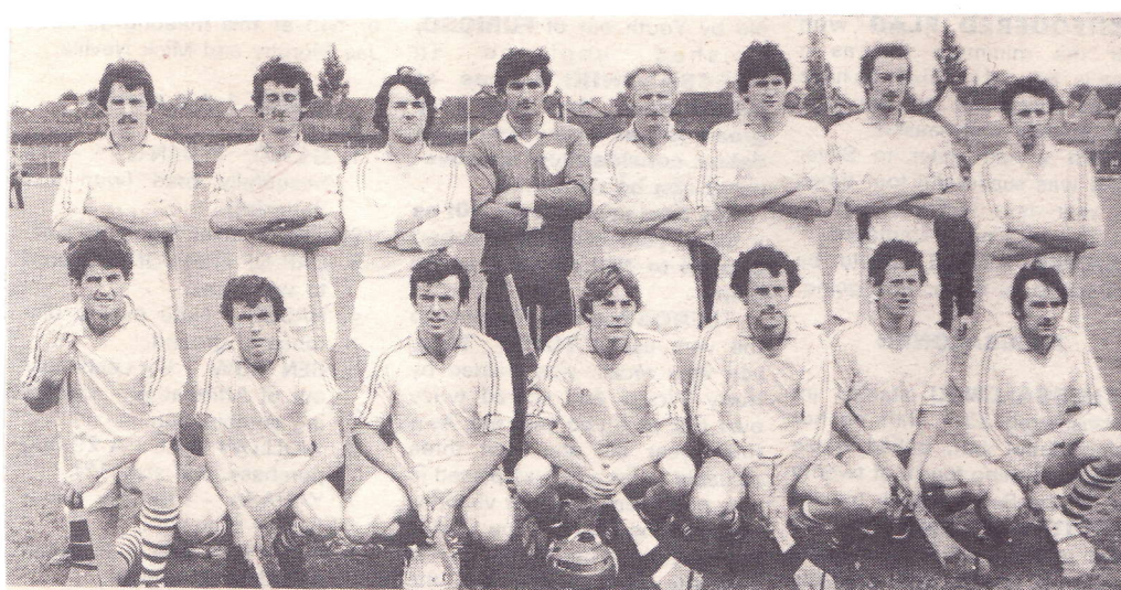
Bruree, the gallant runners-up. 13-9-82