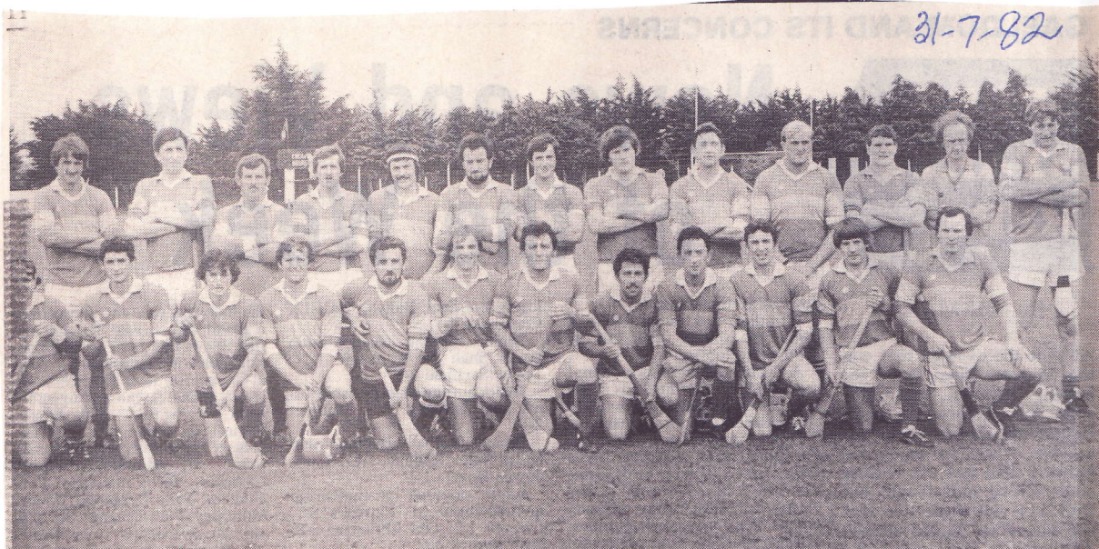
Bruree, holders of the South S.H. title, who played a draw with Croom at Bruff on Sunday last.