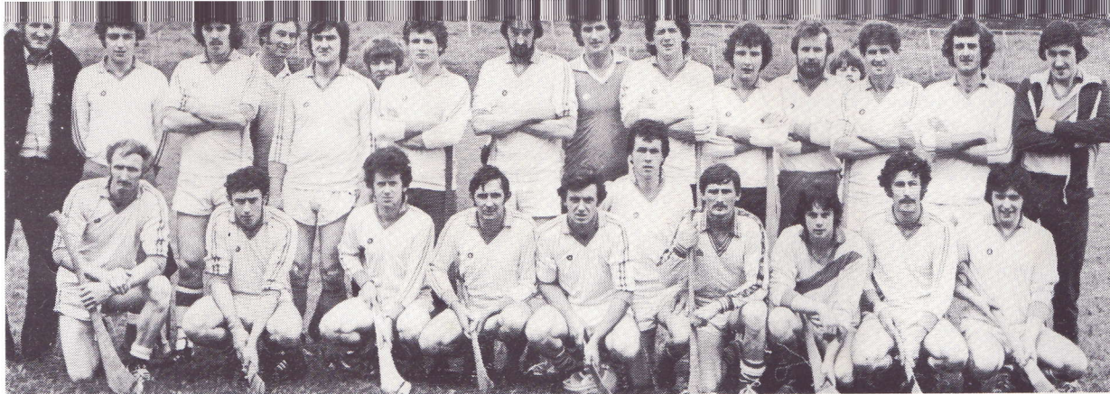
Bruree Senior Hurlers who put in a great performance before losing to South Liberties. 1980