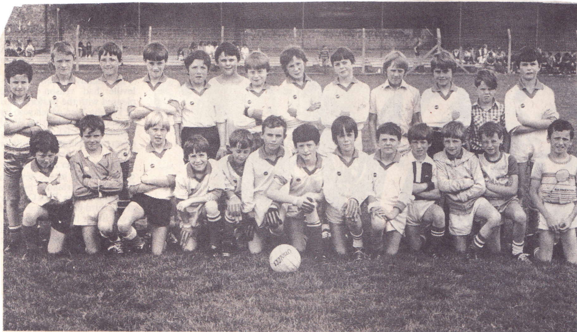
Bruree, winners of the South Limerick under-12 B Gaelic football championship. 20.7.85