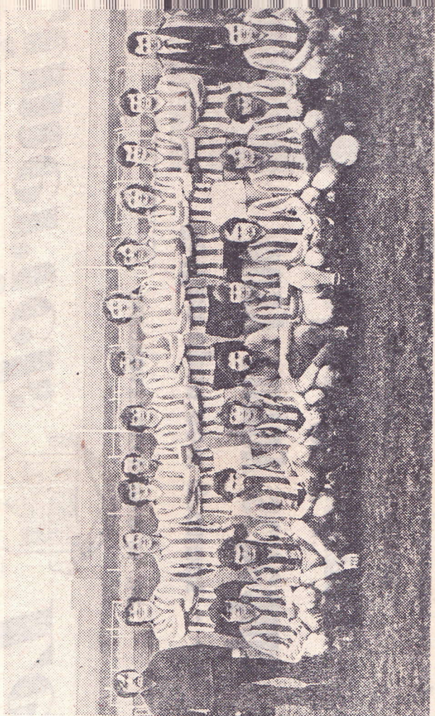
Bruree (left), who beat Fedamore (right), in the final of the County Junior Football Championship.