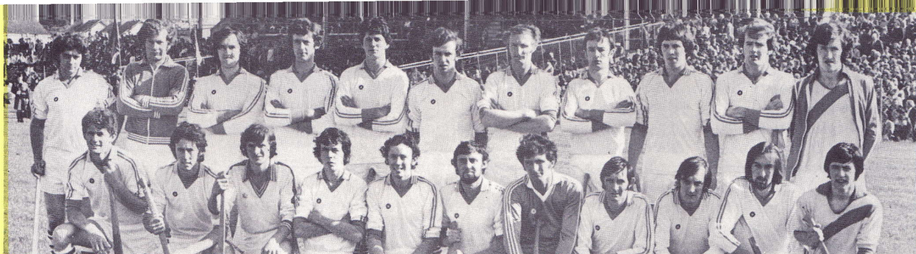
BRUREE South S.H. Champions three in a row, and runners-up Co. Championship.