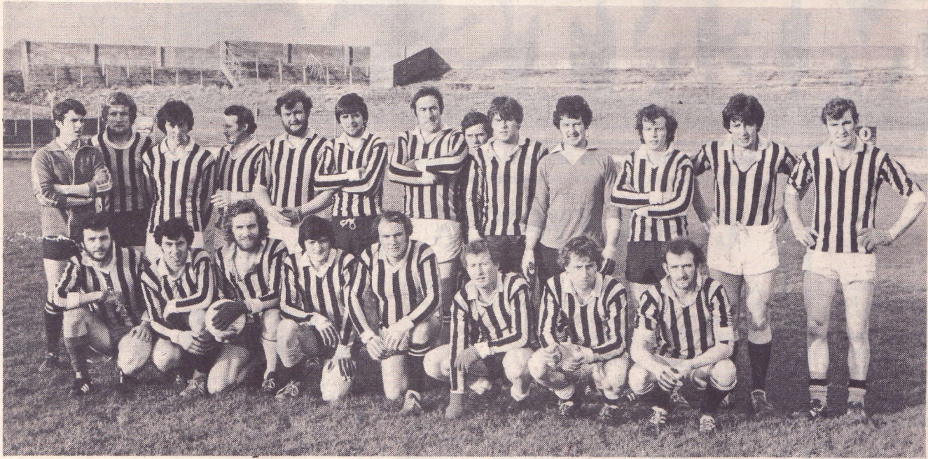
Garryspillane, above, who beat Bruree, below, in the final of the county junior football championship.