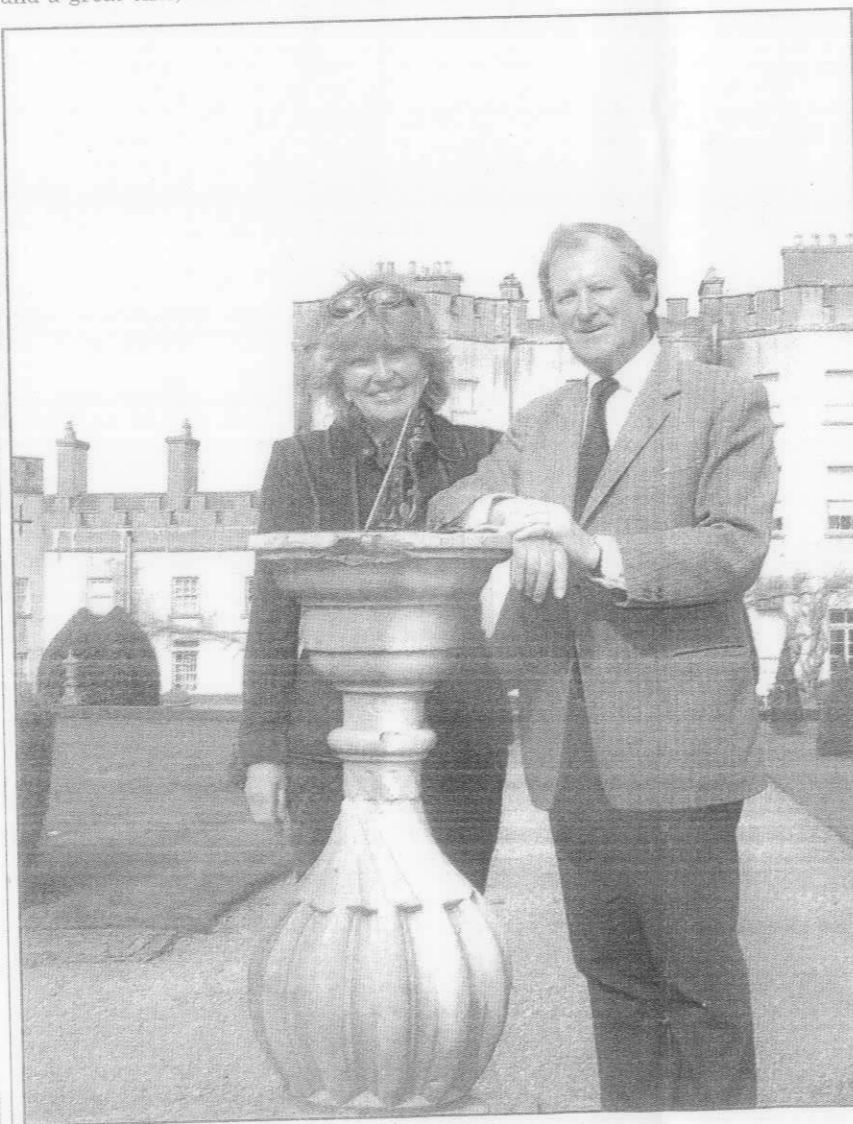
By the sundial in the garden

"to be the remaining representative of that ancient house."