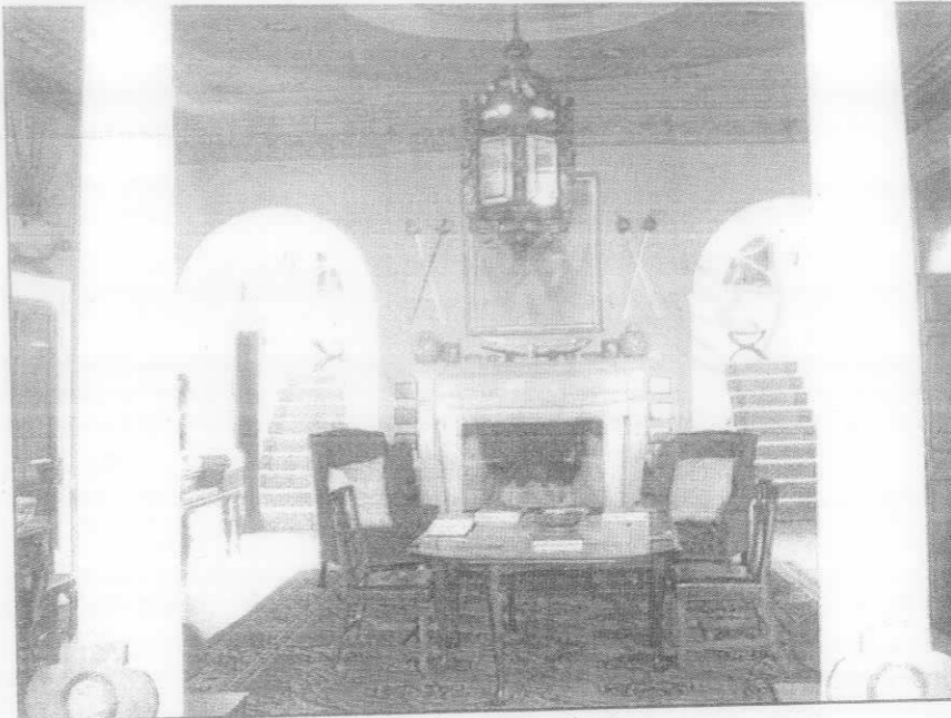
The hall at Glin Castle

Glin has been the home to the FitzGerald for generations. The original castle was situated at the other side of the village