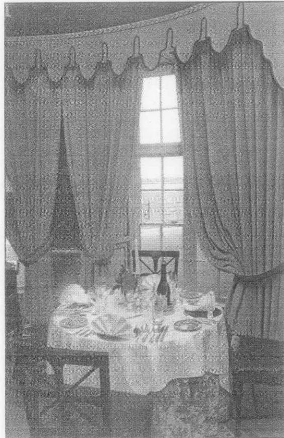
The dining room at Glin Castle, now open for reservations